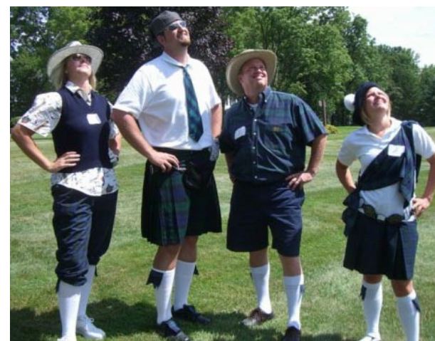
Clan Pedcor took the "Golf TEAM Fashionista" award for their wearing of the kilts.